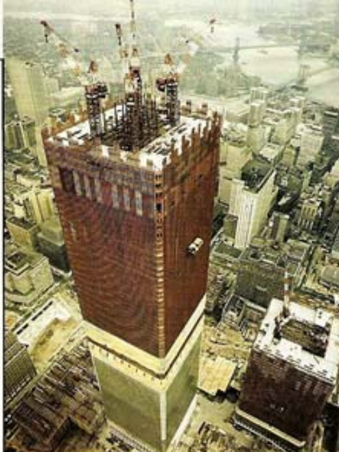
Powerful cores: Construction photos show that the towers' central cores—each comprising 47 box-columns cross-linked by horizontal and diagonal members—gave the buildings powerful internal support. Researchers say these cores would not have entirely failed in a "pancake" collapse.

one. The government's National Institute of Standards and Technologies (NIST) has admitted the South Tower came down in ten seconds and the North in nine. Judy Wood, a mechanical engineer, has observed that even objects in free fall, encountering only air resistance, would require at least 12 seconds to hit the ground, which means the buildings were actually destroyed at a speed faster than freefall.