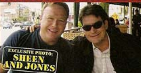
Brothers in arms: Alex Jones with actor and fellow 9/11 Truth activist Charlie Sheen.